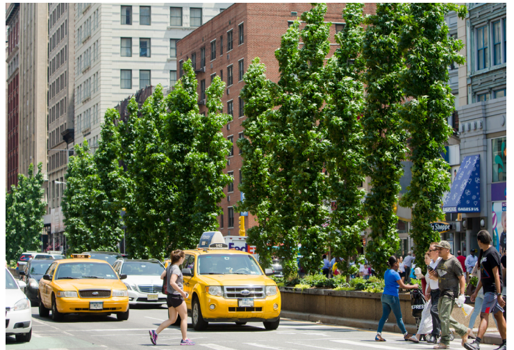
USP's new beautification enhancements line Union Square's east side.

Economic activity along Union Square East and Park Avenue South is flourishing. Union Square Cafe relocated to the corner of 19th Street; new tech companies like Facebook, BuzzFeed, and WeWork have moved in nearby; and the redevelopment of key sites such as Tammany Hall and Mount Sinai Downtown Union Square keep reinventing the area. Public improvements, like protected bike lanes and LinkNYC kiosks, have also enhanced the streetscape. Building on this progress, USP collaborated with a dynamic team of stakeholders and designers to further transform the corridor. With help from NYC Parks, local property owner ORDA Management, and landscape designer HM White, USP overhauled the median malls with a beautiful and lush landscaping design which includes 80 new columnar Sweet Gum trees, shrubs, and perennials. This neighborhood beautification project wouldn't be possible without the generous support of our sponsors: ABS Partners Real Estate, Citibank, Con Edison, The New School, Union Square Hospitality Group, and Urbanspace.