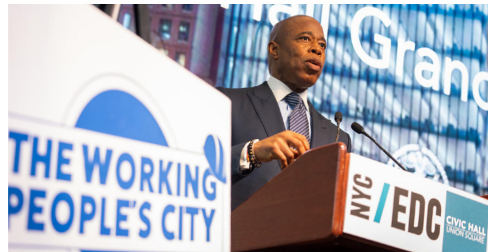
Union Square Partnership joined Mayor Adams, Council Member Rivera, The Fedcap Group, NYCEDC and other key partners at the ribbon-cutting ceremony for Civic Hall @ Union Square.

Alongside Zero Irving, the Union Square district saw a 15.5% increase in employee visits to the area since this time in 2022 , according to Placer.ai. Positive momentum continues in the district with the opening of Via Transportation's new headquarters at 114 5th Avenue and the Q4 announcement that the fintech firm Valon Technologies leased 13,850 SF of office space at 860 Broadway. Valon joins the widely popular co-working space Industrious, which reached 65% capacity in the same building after just 3 months in operation.